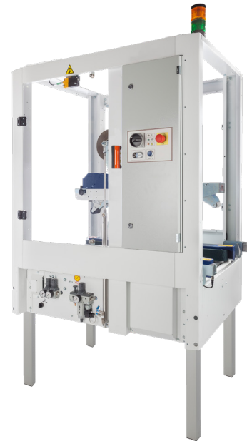
Standard version of the CT 305 SDR